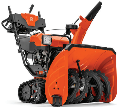
Two Stage 400 series

When you own a Husqvarna snow blower, you can't wait for the snow. Premium engines, precision controls, heavy-duty construction and comfortable operation help power you through any winter.