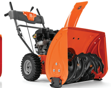
Two Stage 100 series