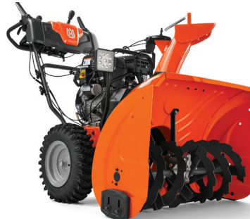
Two Stage 200 series