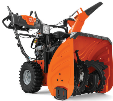
Two Stage 300 series